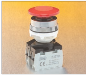
T11AD01-E momentary, 40mm diameter mushroom head, red with clip and two contacts