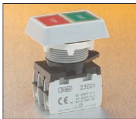
T53QA20-C momentary, twin touch, flush- flush, pushbutton with clip and two contacts