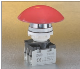
T11AE01-C momentary, 70mm diameter mushroom head, red with clip and two contacts