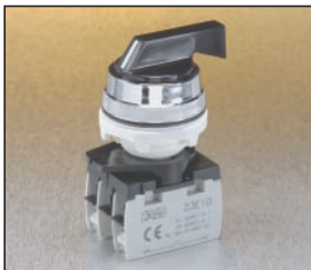
T11MU03-E momentary to center, three position, lever handle, black selector switch with clip and two contacts