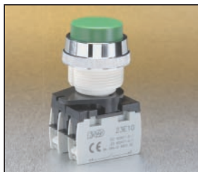
T11AB02-E momentary, round, projected, green pushbutton with clip and two contacts