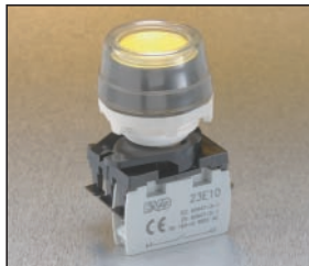
T12AG04-B momentary, round, flush, yellow pushbutton with clip and one contact