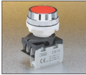
T11AA01-A momentary, round, flush, red pushbutton with clip and one contact