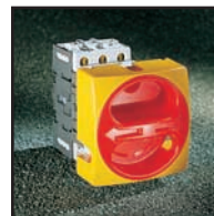
Front mount Ø 22 mm single hole padlockable handle 0172003