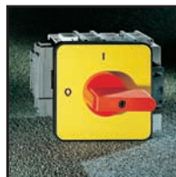
Front mount non-padlockable handle 0172012