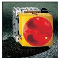
Front mount padlockable handle 0172031