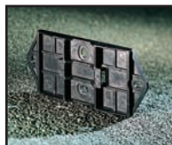
Rear Mounting Plate 0172187 List Price: $1.32