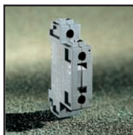
Auxiliary contact NC/NO 0172179