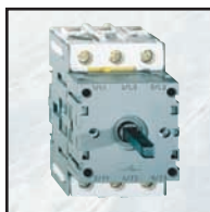
3 pole body without handle 0172000