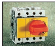
Modular (in-panel) presentation 0172125