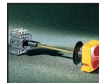
Metal long shaft Extension 0165009LS** Min. Max. 4.92" 15.75"