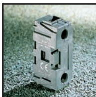
1 pole early make auxiliary contact 0172197