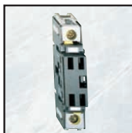
Additional Pole 0172175