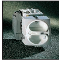
Front mount padlockable handle 0174011