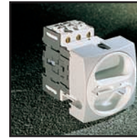
Front mount Ø 22 mm single hole padlockable handle 0174003