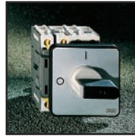
Front mount non-padlockable handle 0174022