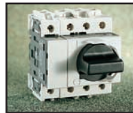
Modular (in-panel) presentation 0174125