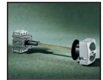
Metal long shaft Extension 0168009LS** Min. 4.92" Max. 15.75"