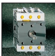
3 pole body without handle 0172300