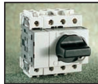
Modular (in-panel) presentation 0174225