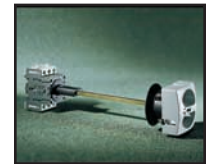
Metal long shaft Extension 0168209LS** Min. 5.31" Max. 16.14"