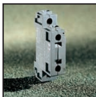
Auxiliary contact NC/NO 0172179