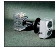
Metal short shaft Extension 0168209SS** Min. 5.31" Max. 10.24"