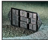
Rear Mounting Plate 0172587 List Price: $2.43