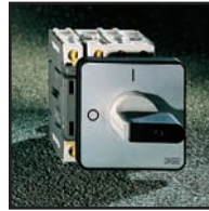
Front mount non-padlockable handle 0174422