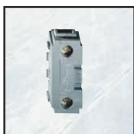
1 pole early make auxiliary contact 0172597