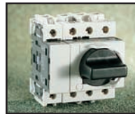
Modular (in-panel) presentation 0172425