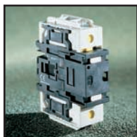
Terminal (junction) block 0172585