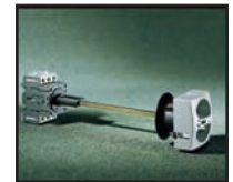
Metal long shaft Extension 0168409LS** Min. 5.71" Max. 16.54"